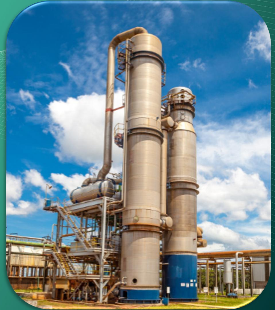
Ethanol Power Plant

These biofuel producers are key players in Brazil's renewable energy transition — combining scale, sustainability, and innovation.