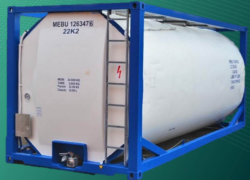
Isotank 25m 3